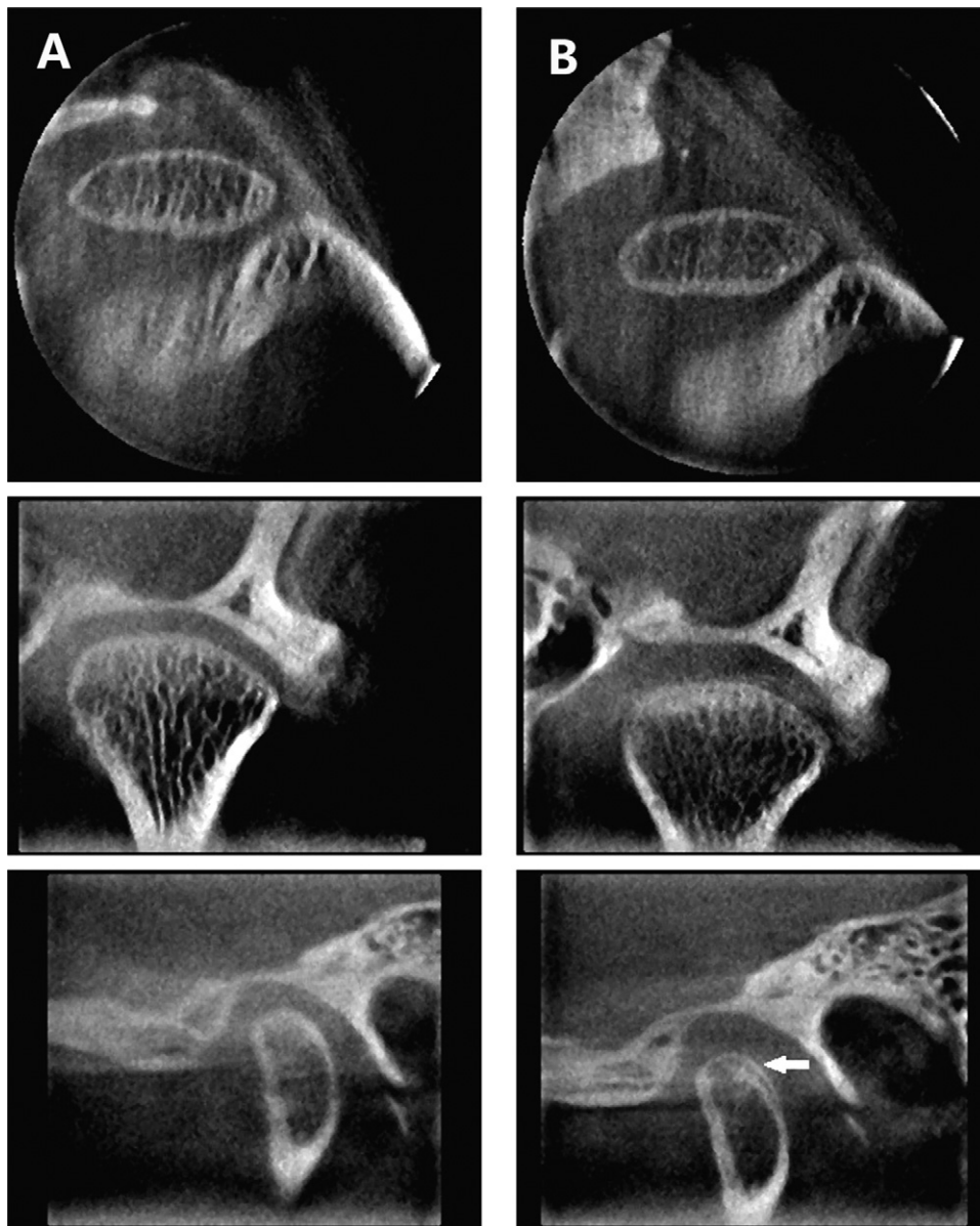
Figure 3. “Double contour” image observed in only 1 plane ( arrow in sagittal image, bottom), from a patient with DDwoR: A , before treatment; B , after ARS therapy.

subsequently reviewed on a 6-monthly basis, and ARS therapy was considered to be successful if signs and symptoms of TMJ closed-lock, including restricted mouth opening, uncorrected jaw deviation, pain, and dysfunction, ceased after splint wear. Results were analyzed with the use of Pearson \chi^2 test at a significance level of .05 using SPSS version 13.0.