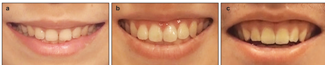
Figure 3 Upper lip curvature. (a) Upward. (b) Straight. (c) Downward.