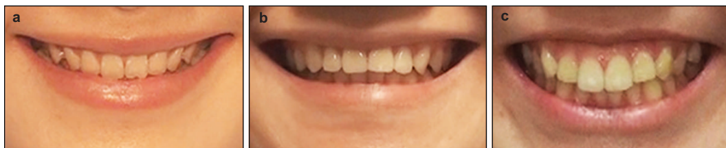
Figure 2 Smile classification. (a) Commissure smile. (b) Cuspid smile. (c) Gummy smile.

In addition, curvatures of upper lip during full smile were measured and categorized using the following criteria (Figure 3): 6-7 (i) upward lip curvature means that the corner of the mouth is at 1 mm higher than a horizontal line drawn through the center of the lower border of the upper lip; (ii) straight lip curvature means that the corner of the mouth at or within 1 mm above and below a horizontal line drawn