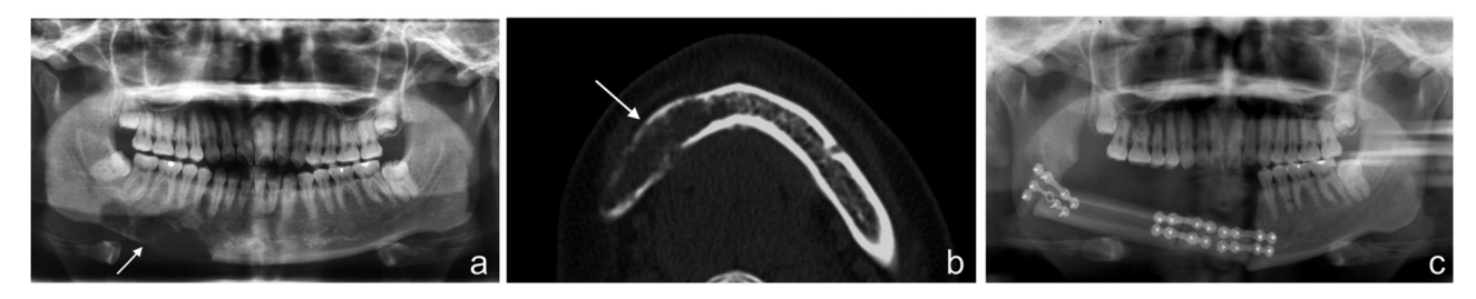
Fig. 1. Radiological manifestations of the primary osteofibrous dysplasia-like adamantinoma in the mandible and the outcomes of treatment. (a) Panoramic radiograph showing a lytic lesion in the right mandible. (b) Computed tomography showing the expansive and osteolytic appearance of the lesion, with cortical destruction. (c) Panoramic radiograph showing the extent of the segmental mandibulectomy and the fibula flap reconstruction.