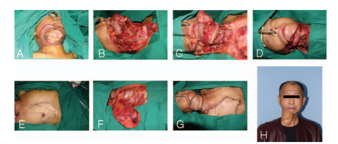
FIGURE 2. A 59-year-old man with the right submandibular region squamous cell carcinoma. (No. 4 from the table 1). A, The tumor is located in the right submandibular region. B, The defect after tumor resection. C and D, Reconstruction of the free fibular flap, and skin defect in the neck remained. E and F, Design of the skin paddle and skin incision, and pectoralis major myocutaneous flap (PMMF) is harvested. G, The PMMF is transferred to the defect and wound is closed. H, Twelve months postoperatively: the appearance of the neck recipient site.

carcinoma and osteoradionecrosis (ORN), followed by placement of PMMF for reconstructive purposes between October 2018 and December 2019 at the Peking University Hospital of Stomatology. This study is approved by the Ethics Committee of Peking University School and Hospital of Stomatology. The details of the demographics and clinical characteristics refer to the supplemental Table 1, http://links.lww.com/SCS/C111.