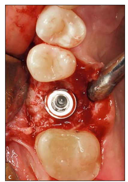
Fig 2 Reentry procedure after an 8-month healing period. (a) Site evaluation. (b) Intrasurgical view showing hard tissue regeneration. (c) Implant placement.