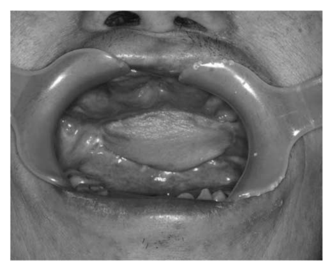
FIGURE 2. The 10-month follow-up results showed an excellent repair effect.

Simultaneously, a skin paddle of 6 \times 4.5 cm was designed and marked in the groin region. We first incised the medial border of the flap, going through the skin and subcutaneous tissue. Then, the superficial circumflex iliac vein and the superficial branch of the SCIA were identified and dissected until a 6-cm pedicle was obtained. Then, we incised the other flap